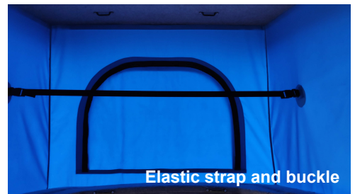
Elastic strap and buckle